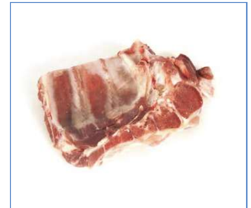
7 Forequarter Ribs.