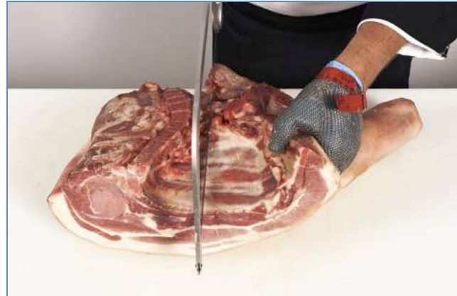
2 Make a mark on the first rib 10 mm from the edge of the neck bone and cut and saw through the bones parallel with the backline.