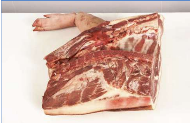
1 Forequarter of Pork.