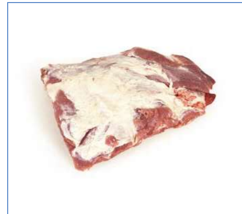
6 Forequarter Ribs.