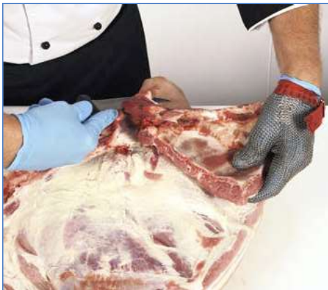
4 To remove the forequarter ribs, follow the natural seam ...