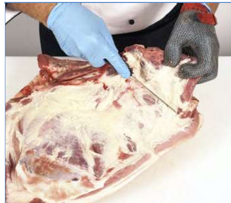
5 ... between the brisket muscle and the ribs.