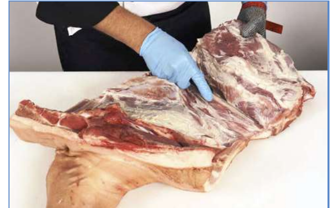
3 Remove the collar by following the natural seam.